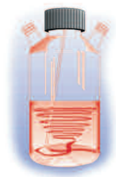
Computer generated image of flow pattern.